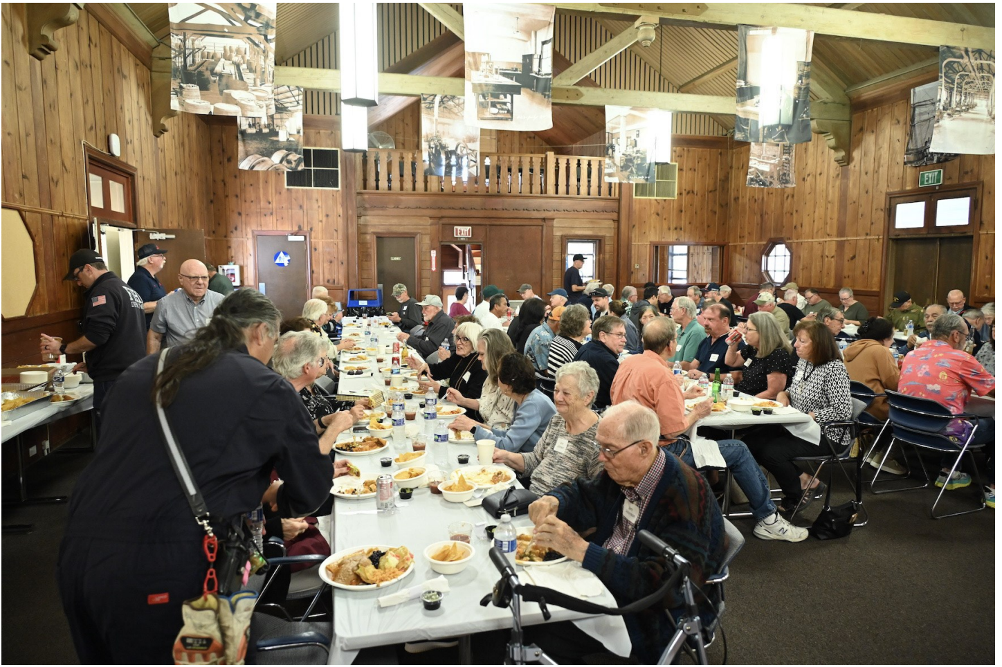
The Mexican lunch was enjoyed by a full house.